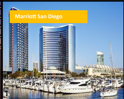
Marriott San Diego