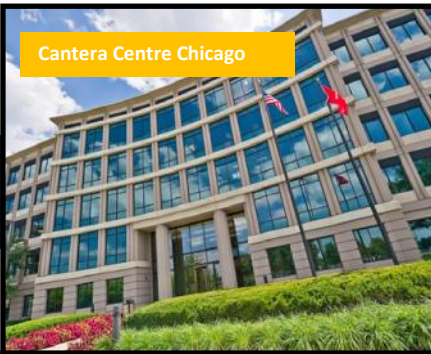
Cantera Centre Chicago