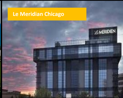
Le Meridien Chicago