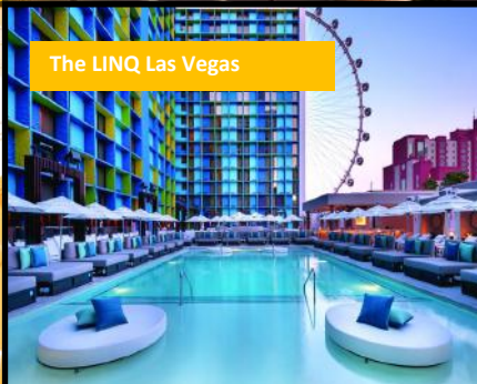
The LINQ Las Vegas