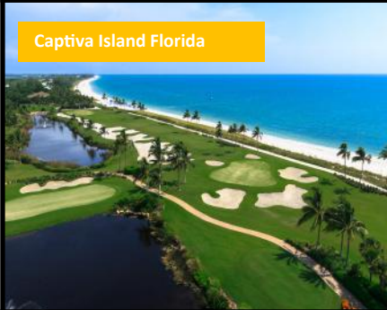
Captiva Island Florida