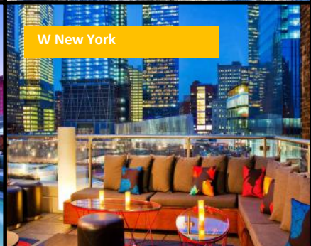
W New York

Axentys extensively reviews conference venues, choosing those that offer the best value to business travellers. We negotiate hotel rates at the venue location to offer maximum on-site convenience at the best price. Furthermore, our venues prime location offers dozens of choices of off-site accommodations from boutique to internationally recognized brands.