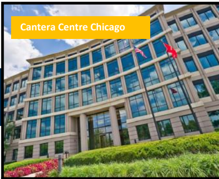
Cantera Centre Chicago