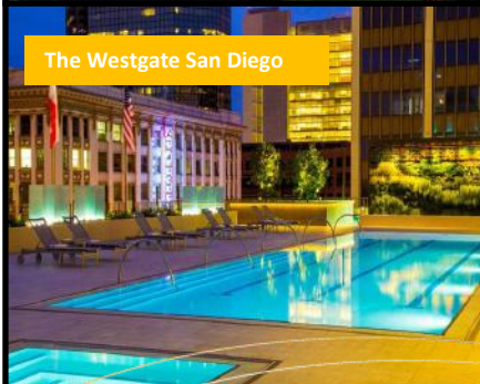
The Westgate San Diego